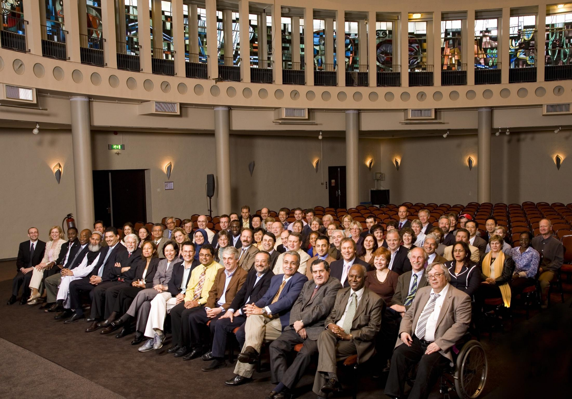
IWGDF Consensus Group, Noordwijkerhout May 2007